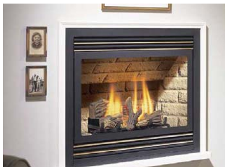
Regency Panorama P33 Gas Fireplace featuring optional gold louvers lined with SKAMOLEX Panel Design, "Cleaved sandstone".

The SKAMOLEX panels are made from exfoliated vermiculite having excellent insulating properties. Vermiculite is the geological name given to a group of hydrated laminar minerals, which are aluminium-iron magnesium silicates. When subjected to sudden, intense heat vermiculite has the unique property of exfoliating.